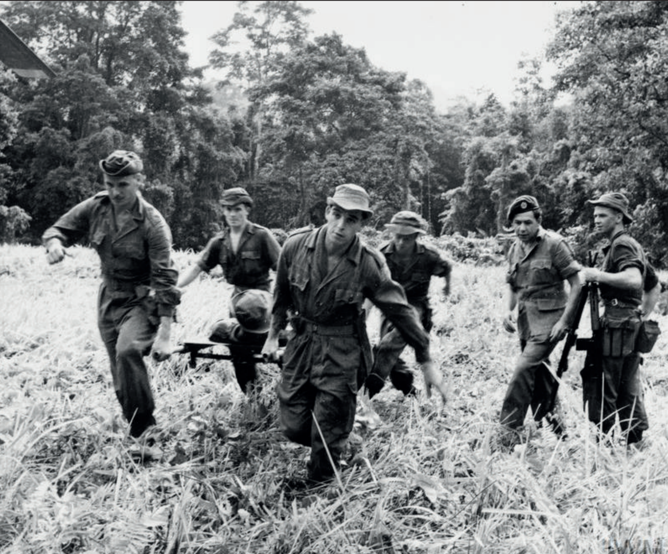
Illustration: The Malayan Emergency 1948-1960, Men of 22 Special Air Service Regiment practice carrying a casualty to a waiting helicopter during a training exercise in a jungle clearing at Ulu Langat, near Kuala

Body Counts: The Administration of Military Losses and Casualties in East & South-east Asian Wars, 1930s-1970s