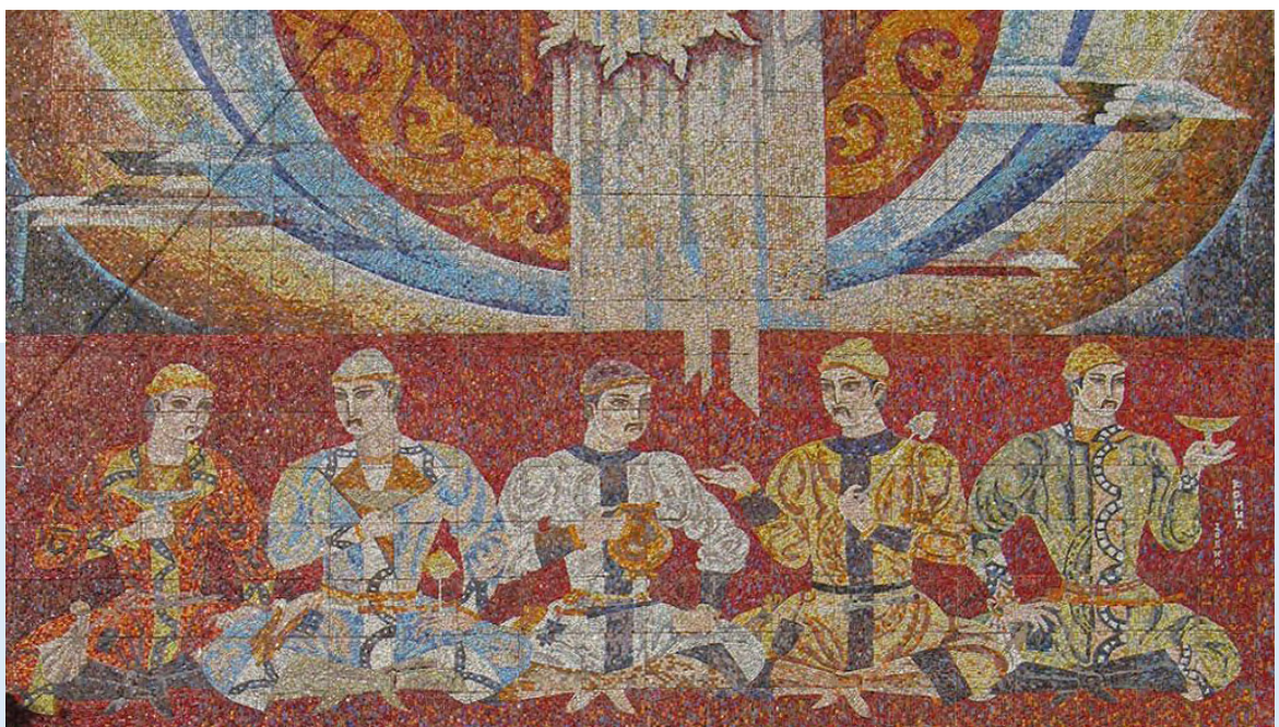
Fragment of the Soviet mosaic of Soghdian pre-Islamic wall paintings in Panjikent, Tajikistan.